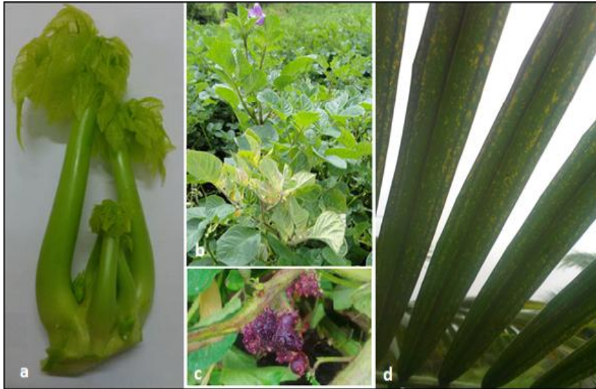
Figure 2. Symptoms associated with diseases caused by Phytoplasma in Ecuador: (a) Twisted neck syndrome on papaya, (b) purple discoloration of new leaves of potato, (c) potato aerial tubers, (d) Lethal wilt initial symptoms on adult oil palm (orange discoloration of leaves).