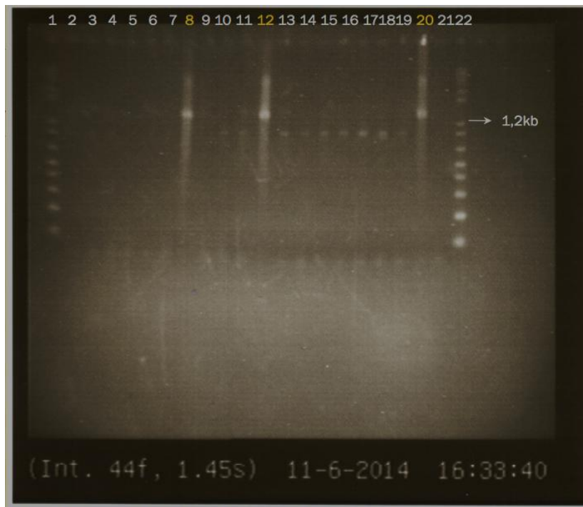
Figure 3. Nested PCR products visualized on agarose gel for: Lane 1: 1kb DNA ladder Invitrogen, lane 2: potato leaf Northern Carchi plant 2, lane 3: potato aerial tuber plant 2, lane4: potato aerial tuber plant 4, lane 5 papaya plant 2, lane6: papaya plant 5, lane 7: papaya plant 6, lane8: papaya plant 7, lane 9: potato healthy plant 1, lane10: potato leaf-plant 1, lane 11: potato aerial tuber-plant 1, lane12: potato leaf-plant 2, lane 13: potato aerial tuber-plant2, lane 14: potato leaf-plant 3, lane 15: potato aerial tuber-plant 3, lane 16 potato leaf-plant 4, lane17 potato aerial tuber plant 4, lane 18: potato leaf-plant 5, lane 19: potato aerial tuber-plant 5, lane 20: lethal wilt of oil palm phytoplasma palm 2, lane21 water control, lane22 1kb DNA ladder.