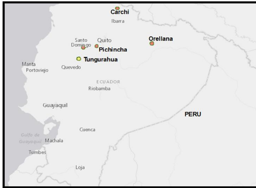
Figure 1. Map of Ecuador (not to scale) showing sampling localities (orange dots) for potato (Carchi and Pichincha), papaya (Santo Domingo), and oil palm (Orellana and Santo Domingo). Tungurahua (yellow dot) is the location where potato purple top is being spread.

oil palm was extracted according Baer et al. (2013), and it was used as positive control. Vascular tissues from leaf veins, branches, and tubers were ground in sodium metabisulfite to avoid oxidation. DNA was extracted using protocols proposed by Ferreira and Grattapaglia (1998), Colombo et al. (1998) adapted by Piedra (Morillo and Miño, 2011), and extraction with the commercial kit PureLink Plant Total DNA (Invitrogen, Life Technologies, NY, USA), following the manufacturer instructions. After extraction, DNA was quantified in an EPOCH spectrophotometer (Biotek, Winooski, VT, USA).